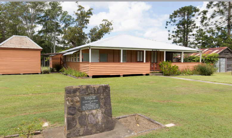
Bankfoot House