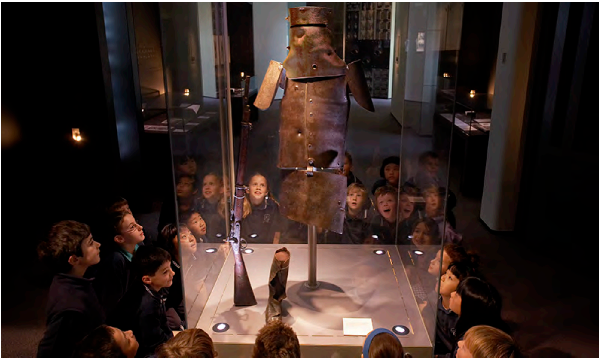
Ned Kelly's armour, State Library of Victoria