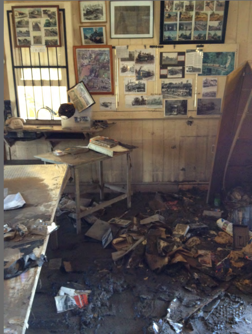
Railway carriage, Bundaberg Historical Railway Museum after 2013 floods..