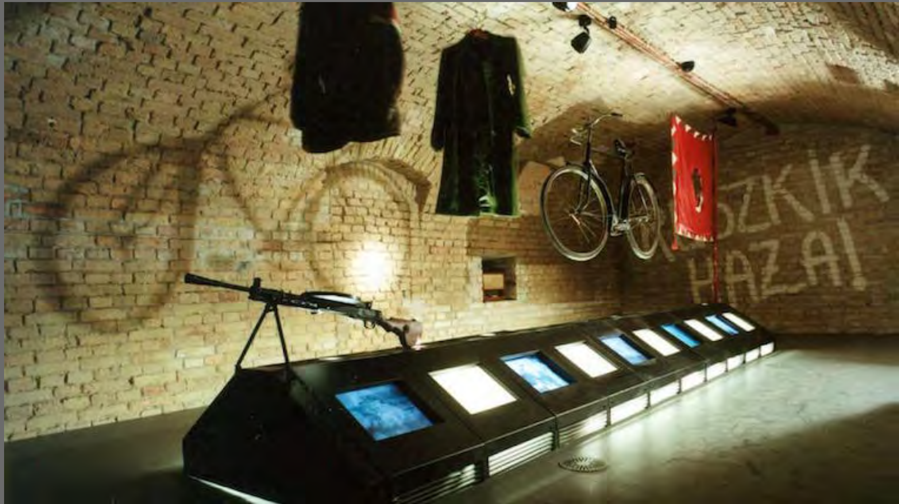
Terror Haza Múzeum , Budapest.