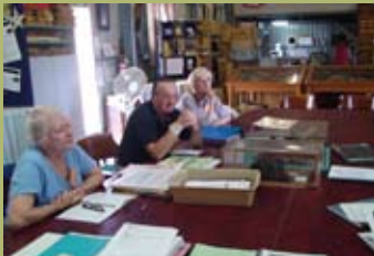
Hard at work on original boardroom table