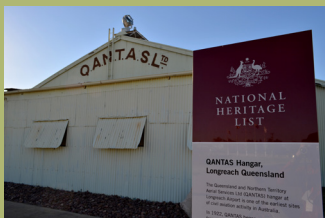
The Heritage Listed Original Qantas Hangar.