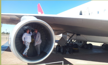
Part of the amazing tour experience at the Museum.