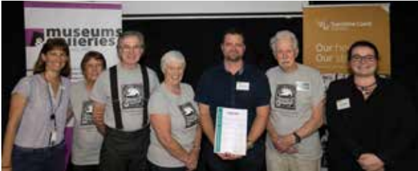
Friends of Bankfoot House and Sunshine Coast Council representatives celebrating the completion of the Standards Review Program.