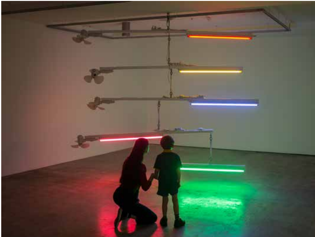
Ross Manning, Spectra XIII , 2017. Fluorescent lights, fans, timber, acrylic paint, and steel cable. Installation view, Dissonant Rhythms , Institute of Modern Art, 2017.

Dissonant Rhythms is organised by Institute of Modern Art and toured by M&G QLD, and will open at Caboolture Regional Art Gallery on 2 February 2018. For more information, see page 14 of this issue of source .