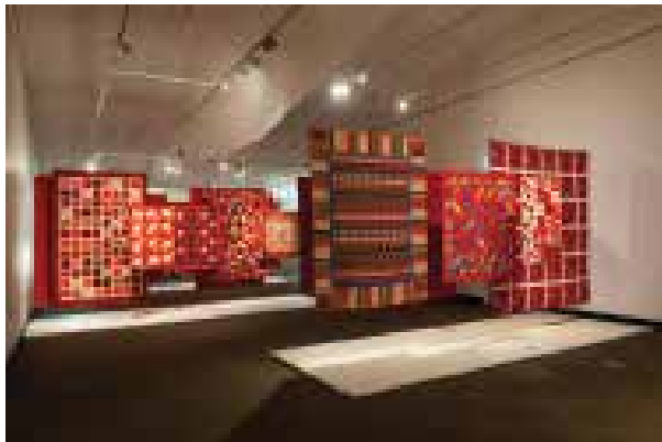
Image: Red: The Henzell St Quilters exhibition.