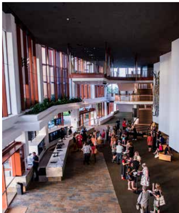
Guests arriving at the Cairns Performing Arts Centre for the GAMAA presentation event.

M&G QLD also acknowledges the support of Public Galleries Queensland and Australian Museums