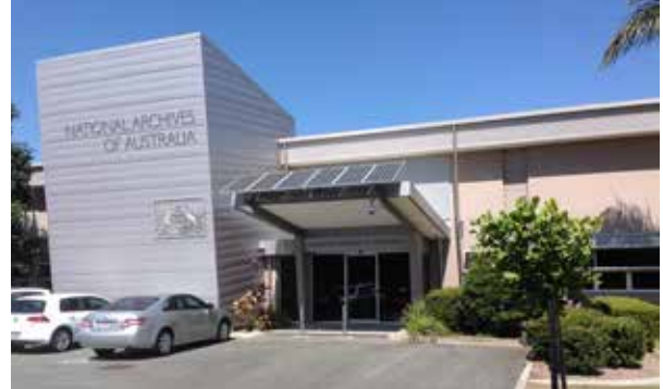
M&G QLD Staff visited the National Archives of Australia Brisbane office at Cannon Hill.