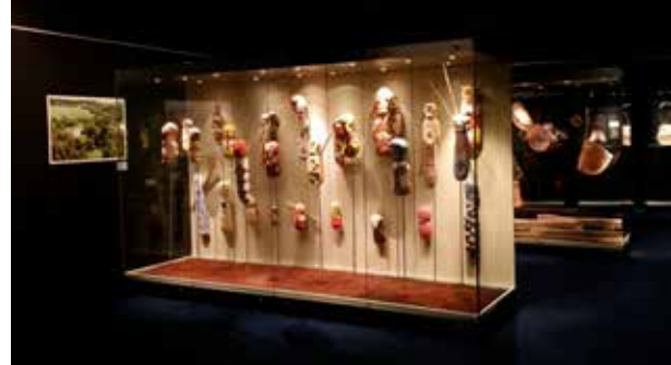
Some of the artworks on display in Manggan – gather, gathers, gathering at Museum of Tropical Queensland.

The exhibition is a partnership between Giringun Aboriginal Art Centre in Cardwell, far north Queensland, and the South Australian Museum. M&G QLD is touring the exhibition to fourteen national venues from 2017 to 2021. It is on display at MTQ until 11 February 2018.