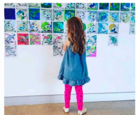
Zoonotic Wallpaper program at Tweed Regional Gallery, images courtesy of Jennifer Andrews and Trish Callaghan.