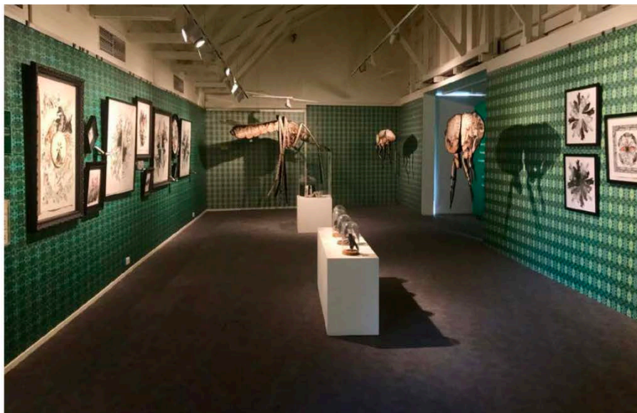
ZOONOSSES at Logan Art Gallery, 19 October – 24 November 2018