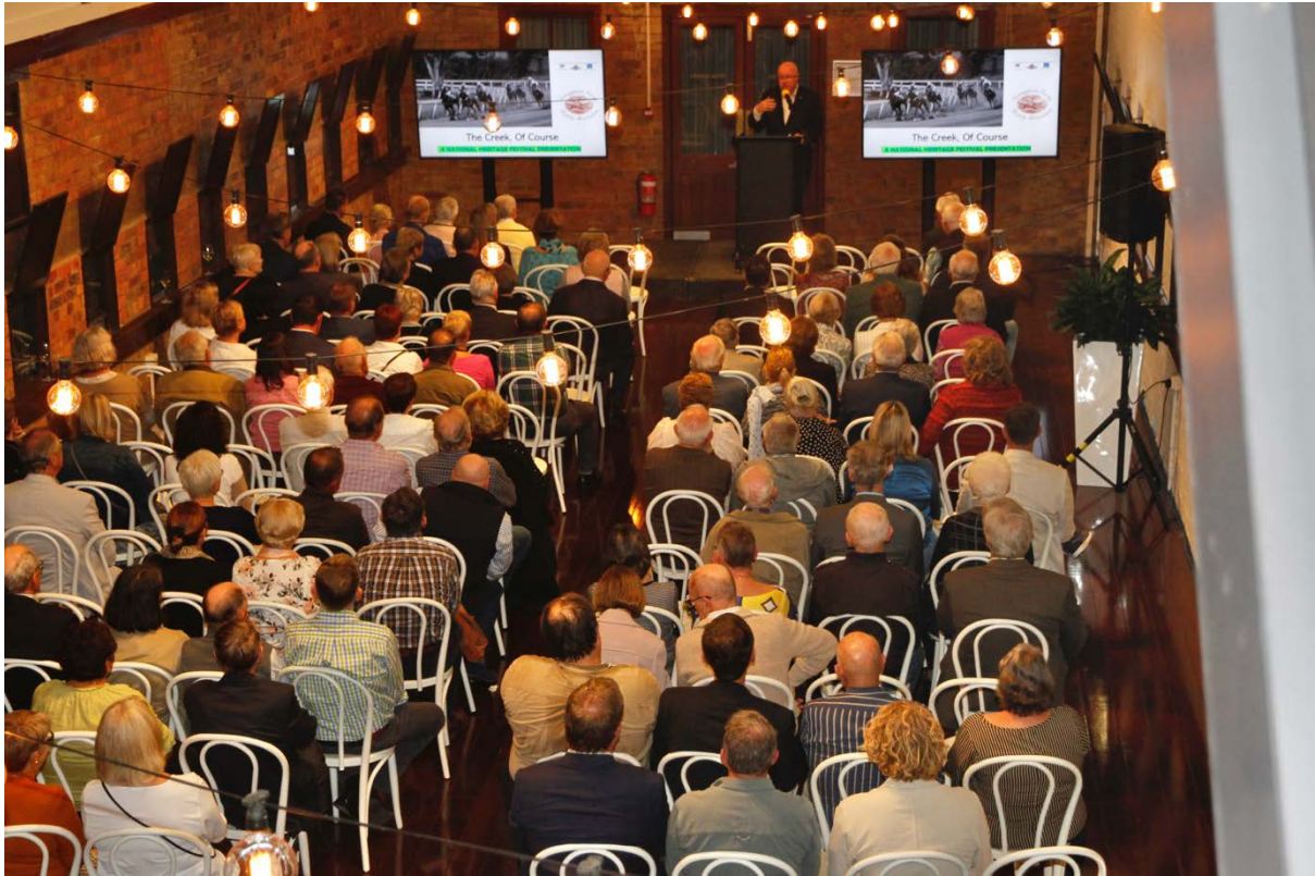
Image Caption: The Thoroughbred Racing History Association's 2022 National Trust Heritage Festival Event – A Creek, of Course . The organisation holds this event annually in celebration of historic racing events and to showcase their impressive collections.