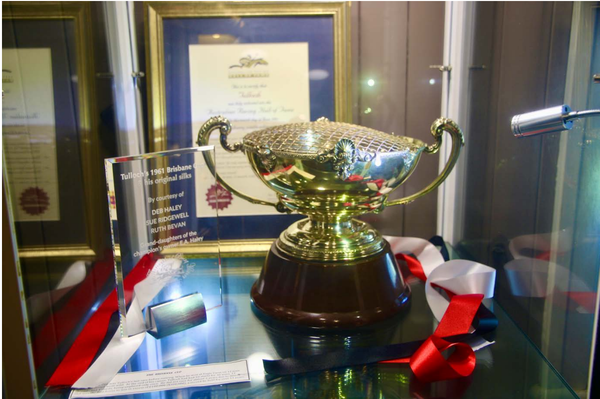
Image Caption: Tulloch's 1961 Brisbane Cup from the Queensland Horse Racing Museum collections.