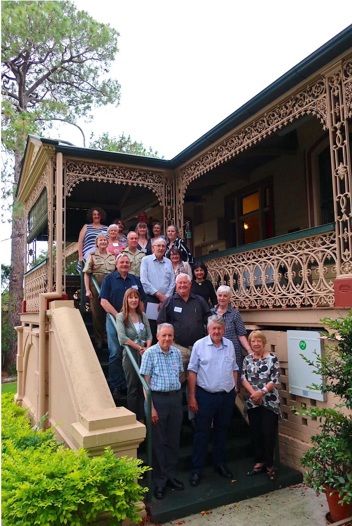
Image Caption: The participants of the 2024 Standards Review Program together at Miegunyah House Museum.