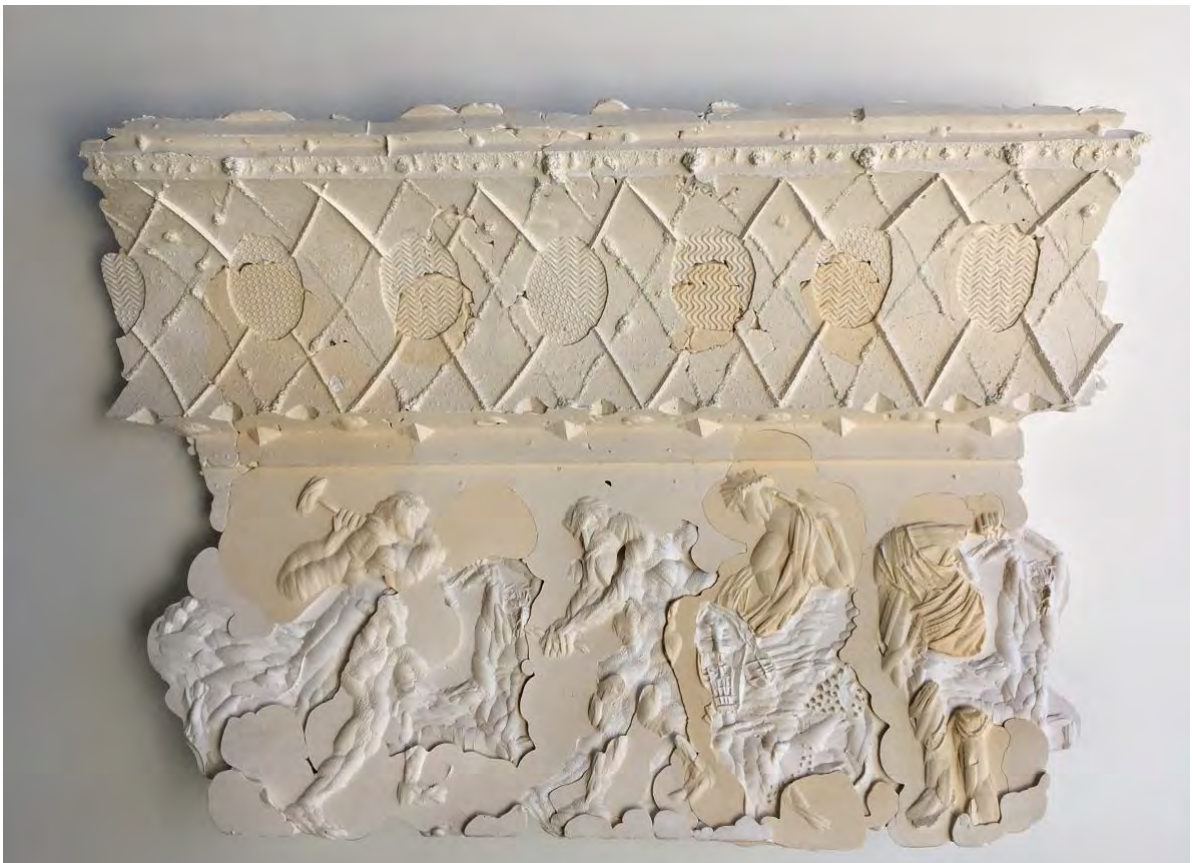
Top Left: Bruce Reynolds, Vase with Fruit Bat , 2012 Top Right: Bruce Reynolds, Wedgewood Cuirass , 2017 Bottom: Bruce Reynolds, Cornice , 2016