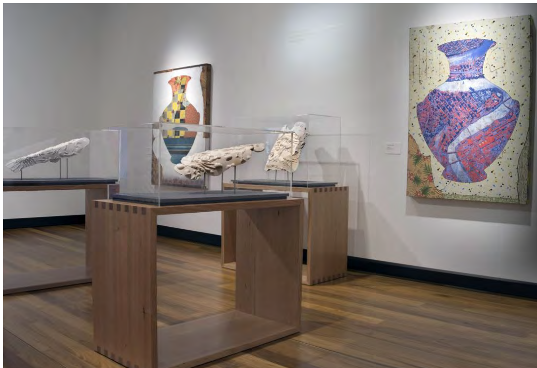
Top: Oxiana installed at Griffith University Pop Gallery space, QLD, 2016 Bottom: View of Grieves 2013 (in vitrines) and Bulimba Hydria 2013 (left) and City Reach Hydria 2013 (right) installed in the exhibition David Malouf and Friends , Museum of Brisbane, 2014