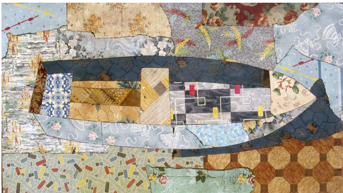
Top: Bruce Reynolds, Corona , 2017 Bottom: Bruce Reynolds, Dry Boat , 2014