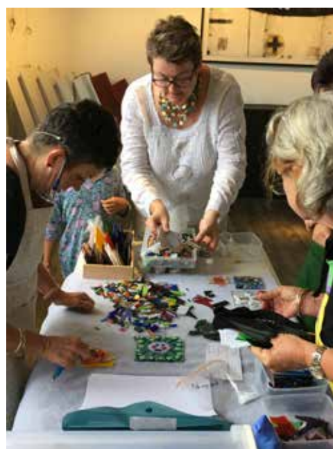
Top: Jo Bone, Seaweed II , 2014. From In Depth . Blown glass, cold worked, 65 x 18 cm.