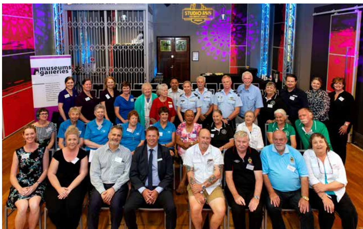
Final celebration for participants and stakeholders in the 2018 Standards Review Program.

'We are also keen to adopt new guidelines and write procedures that we have lacked up until now. The Reviewers reminded us what an incredible gallery we have and how fortunate our community is to have an exhibition space with so much potential.'