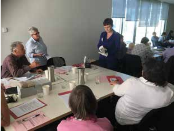
Significance Assessment Workshop participants brought a collection item to discuss.