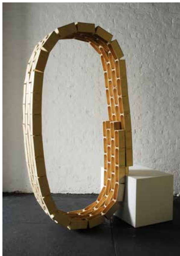
Tim Sterling, B.E.L.T. , 2012. From Safe Space contemporary sculpture . Plywood, hardwood, MDF, screws, nuts, bolts, 307 x 170 x 84 cm. Photography: Tim Sterling. Photograph courtesy of the artist and Hugo Michell Gallery.

Some people are stories is a touring exhibition in partnership between FireWorks Gallery and Museums & Galleries Queensland. This project is supported by the Queensland Government through Arts Queensland. This project has also been assisted by the Australian Government through the Australia Council for the Arts, its arts funding and advisory body, and supported by the Visual Arts and Craft Strategy, an initiative of the Australian Federal, State, and Territory Governments.