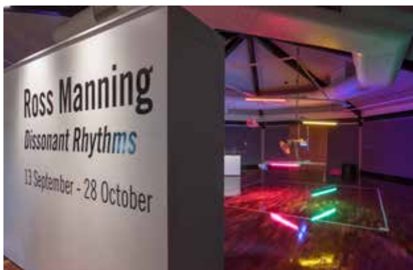
Dissonant Rhythms displayed at Tableland Regional Gallery, Atherton.

Modern Art (IMA), brings together works from the past eight years that immerse audiences in mesmerising encounters with light, movement and sound, scored by carefully manipulated or constructed technologies, and which push the boundaries between artwork and gallery, exhibition and performance.