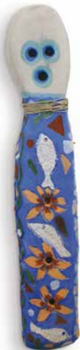
Nancy Cowan, Bagu , 2016. From Manggan – gather, gathers, gathering . Ceramic with string, 68.5 x 12 x 6 cm. Courtesy of Girringun Aboriginal Art Centre.