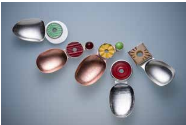
Catherine Large, Group of Multichrome Shovels , 2017. From USE . Sterling silver with various materials, (L-R) 80 x 36 x 8 mm; 88 x 32 x 8 mm; 87 x 32 x 10 mm; 86 x 36 x 6 mm; 75 x 32 x 10 mm.