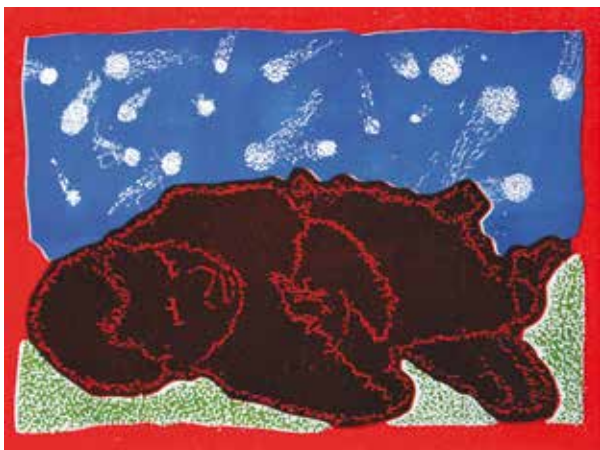
William Hunt, Me and My Thoughts , 2012. From Reasonable & Necessary: prints and artist books by Artel Artists . Reduction relief print, 33.5 x 45.5 cm. Courtesy of the artist and Artel. Photography: Vanessa Xerri.

by the Visions regional touring program, an Australian Government program aiming to improve access to cultural material for all Australians; the Queensland Government through Arts Queensland; the Visual Arts and Craft Strategy, an initiative of the Australian, State and Territory governments; and is assisted by the Australian Government through the Australia Council, its arts funding and advisory body.