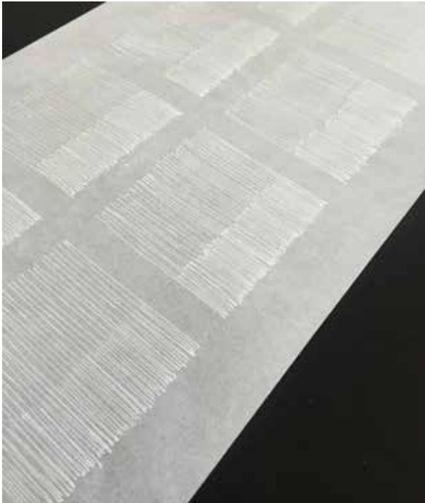
Susan Lincoln, (detail) Untitled (TIME 2011-) , 2011 ongoing. Acrylic, ink on paper, clothbound hardcover logbook with tracing paper leaves, dimensions variable.

This exhibition provides numerous opportunities for meditation and mindfulness activities in the gallery, with a suite of public programs to accompany the show.