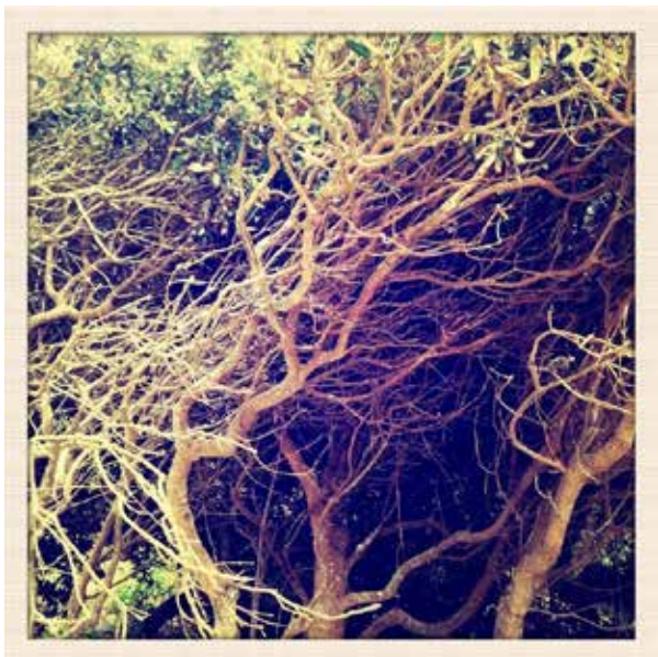
Kay S Lawrence, Varicose , 2011. From Material Matters . Digital image archival pigment on canvas, 80 x 80 x 4 cm.