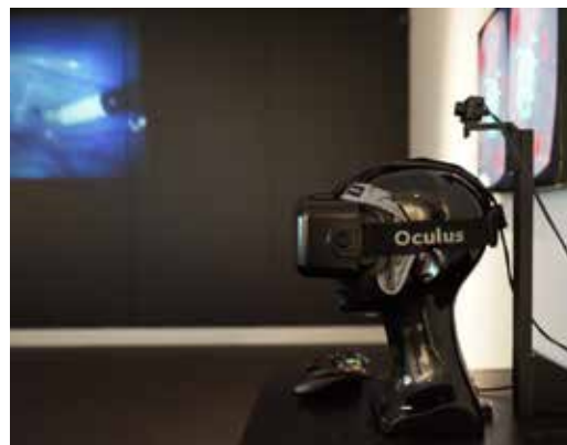
People Like Us on display at Caboolture Regional Art Gallery, QLD (left) and at Dogwood Crossing at Miles, QLD (right).