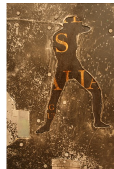
Readers Digest Atlas of Australia Vol. 1 - 6 2 of a series of 6 2012 Mixed Media

Despite the possibility for sentimentality associated with the images and iconography that Glen works with, there is little room for nostalgia; rather there is something disquieting in the way he obliterates elements of the past with slashes of red ink, roughly hewn sutures of thread, or opaque layers of encaustic.