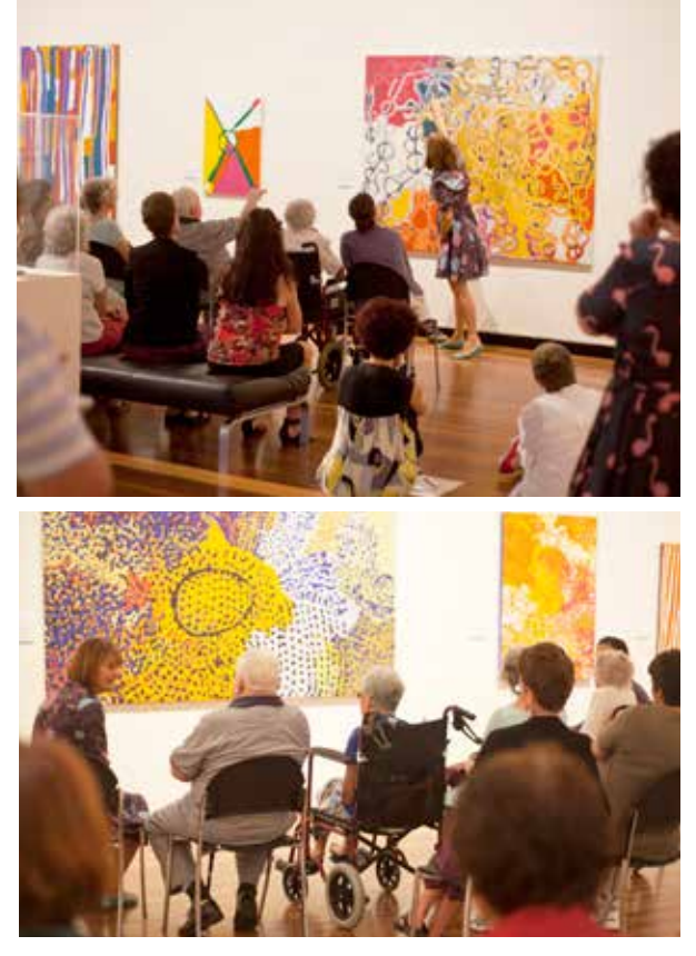
Participants at the Art and Alzheimer's Outreach Program workshop at Artspace Mackay.

All who attended expressed the desperate need for programs of this kind in our region for people living with Dementia, and much of the feedback indicated that participants valued and learned a lot from attending the workshop. Many also offered their assistance to be part of a future program of this type here at Artspace Mackay."