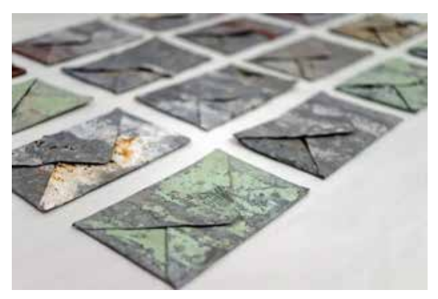
Glen Skien, letters from country 1 (detail), 2013, mixed media iron envelopes, dimensions variable. Series of 50.

MYTHO-POETIC: Print and Assemblage Works by Glen Skien will interrogate the human condition with 35 artist books, assemblages, collages and