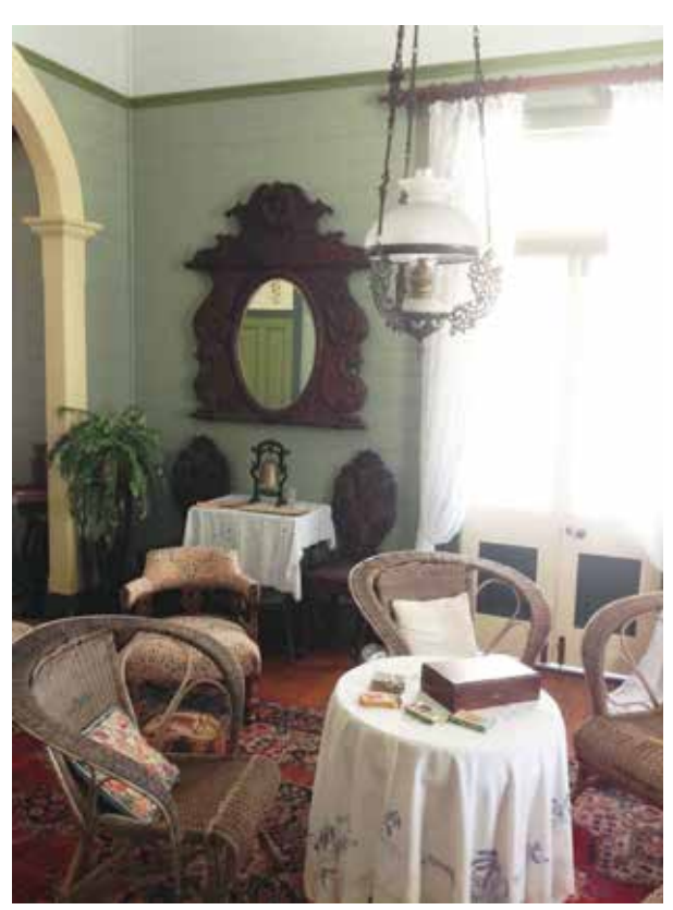
The sitting room in 'Currajong', one of the buildings at the Townsville Heritage Centre.