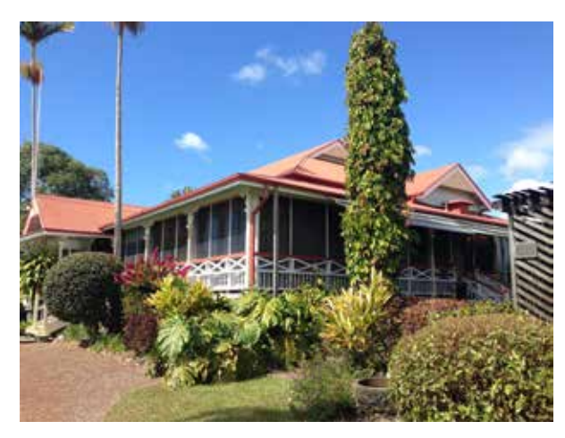
The picturesque Greenmount Homestead in Mackay.

(Communications Officer) attended the opening of Saltwater Country exhibition at Gold Coast City Gallery on 19 July.