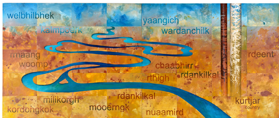
Ian Waldron, The Norman River, Kurtjar Country (Gulf of Carpentaria) (detail), 2014. Acrylic and oil on canvas board, 100 x 240 cm. From Saltwater Country .