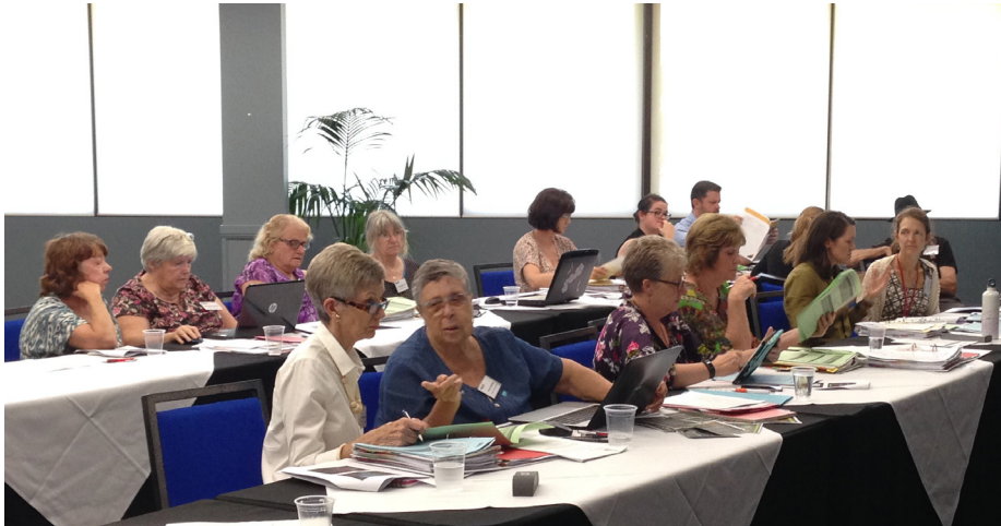
Standards Briefing Session held at the Events Centre Caloundra on 9 March 2017. The organisations represented included: Bankfoot House; Discover Eumundi Heritage & Visitor Centre; Noosa Library Service – Heritage Library; Noosa Museum; Pioneer Cottage Buderim; Sunshine Coast Art Collection; and Yandina Historic House.

schedule and to begin the important task of completing the Self Review Survey. The session allowed organisations to ask specific questions and learn how to access relevant resources for completing the Self Review Survey.