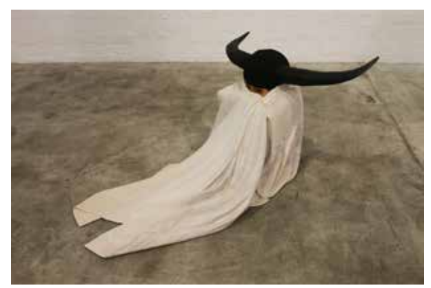
Abdul-Rahman Abdullah, The boy who couldn't sleep, 2017. Painted wood, buffalo horns, 56 x 127 x 74 cm.

M&G QLD has been successful in its application to the Australian Government's Visions of Australia program to support development of its contemporary Australian sculpture exhibition, Safe Space . The exhibition is a partnership between M&G QLD and Logan Art Gallery, and is curated by Christine Morrow. Safe Space will launch at Logan in November 2018 and is then planned to tour until 2021, subject to further funding.