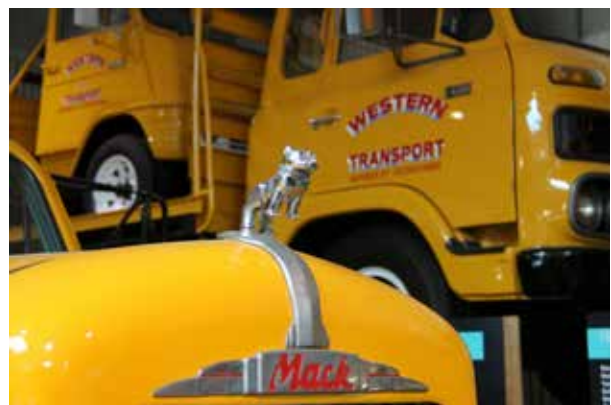
Western Transport Exhibit at the Queensland Transport Museum – A truck, on a truck, on a truck.

Built in 2009, the Queensland Transport Museum is situated inside the Lockyer Valley Cultural Centre, Gatton. Visitors to the Museum can explore a diversity of vehicles, memorabilia and other displays that explore the history, founders and functions of the transport industry in Queensland. Featured displays include the Western Transport Exhibit and Nolan's Interstate Transport Exhibit, as well as a display of over 200 models, including vintage matchbox cars.