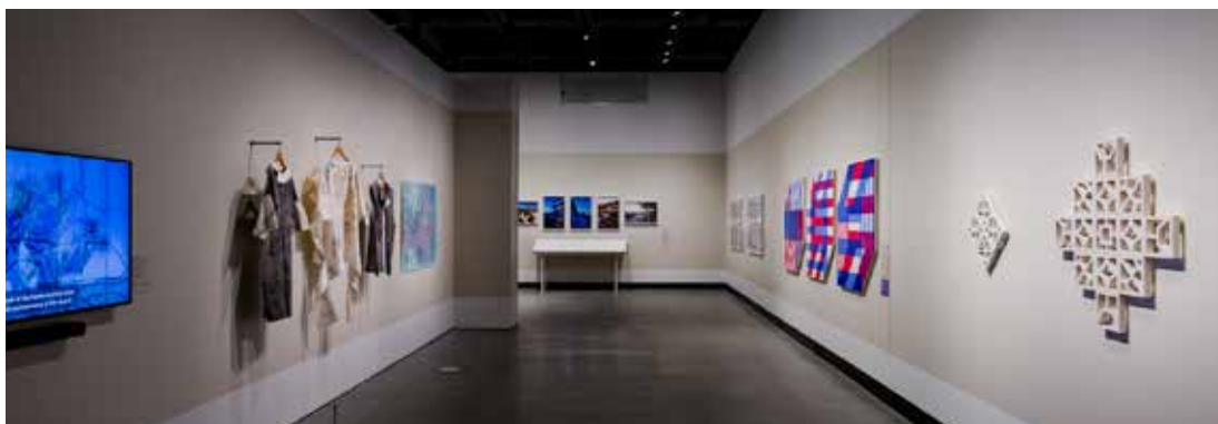
Lost in Palm Springs on display at HOTA Gallery, Gold Coast.

Connections between Palm Springs and Australia are remarkably strong, particularly when viewed through the lens of the current renaissance of