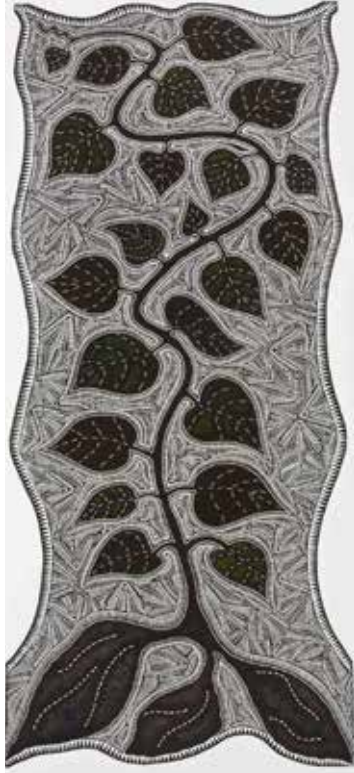
Billy Missi, Gabau Sir Sir | Tangle of Yam Bushes , 2008. Linocut printed in black ink from one block, hand coloured Kaidaral, paper: Hahnemüle 350 gsm, matrix: 1545 x 662 mm. Edition: workshop proof. Publisher: Djumbunij Press, KickArts Fine Art Printmaking, printer: Theo Tremblay.