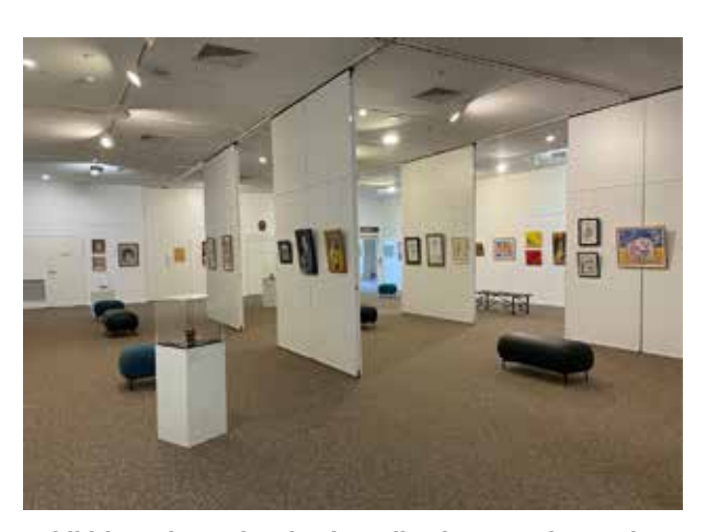
Exhibition view of Eclectic Collections at the Lockyer Valley Art Gallery.

discussions during the tour and the Self Survey Reviews, into which the Gallery and Museum put a lot of effort in the past few months. This is the start of the action plan development and will continue at the On-Site Review planned for November.