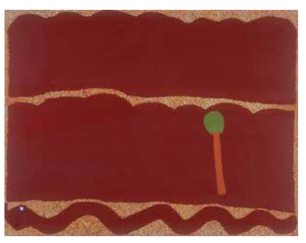
Long Tom Tjapanangka (born 1929–2006), Pintupi/ Ngaatjatjarra language groups. Mereenie Range with Sacred Tree and Snake, 1996. Acrylic on linen, 152 x 198 cm. © Long Tom Tjapanangka I Aboriginal Artists Agency Ltd.