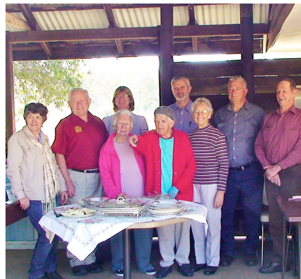
Eidsvold Museum.

Country hospitality on the field visit to Eidsvold Historical Complex.