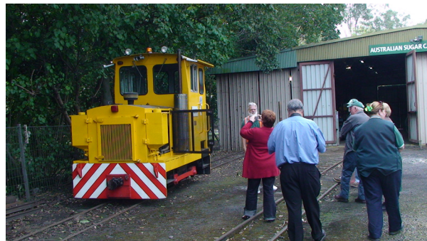
Australian Sugar Cane Railway.

The following photographs represent the museums and galleries involved in the 2012 Standards Review Program Field Visits: