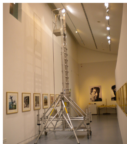
Top: Aberystwyth Arts Centre, Wales. Centre: School of Art. Bottom: The gallery at the Arts Centre.