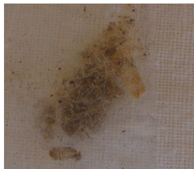
Christine bagged up the evidence of insects found when the object was vacuumed. This can be sent for identification to the Queensland Museum.