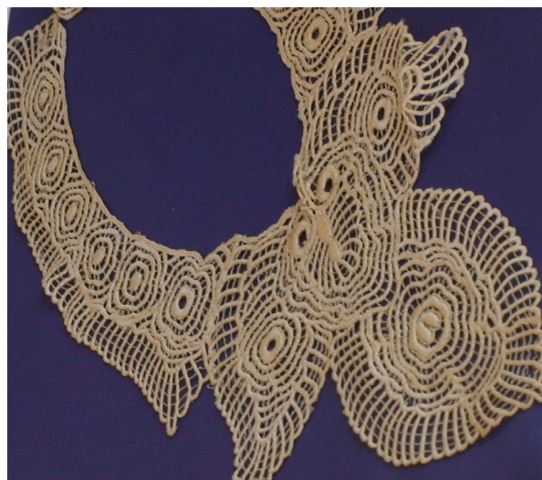
Christine demonstrated how good blue would be as a background to display this textile.