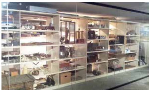
The fantastic glass wall to the Collection Store at the Australian Stockman's Hall of Fame.

The following photographs represent the museums and galleries involved in the 2013 Standards Review Program Field Visits: