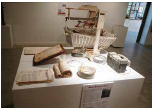
A selection of objects on display from the Significantly Tambo: Celebrating 150 Years of Tambo Township exhibition at Grassland Art Gallery.