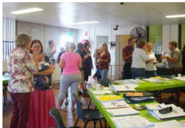
Participants networking over morning tea at the 2013 Securing Funding Workshop at the Bundaberg Regional Art Gallery.