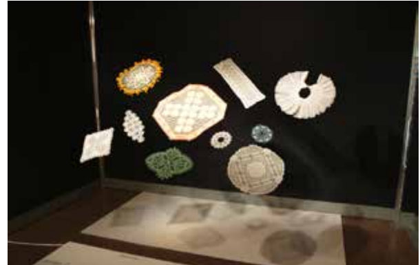
Left and Above: Reflecting on design in the Powerhouse Museum's Love Lace exhibition inspires a display of local lace at Caloundra Regional Gallery.

26 people attended this networking session and participated in robust discussion sparked by presentations from two speakers and two participants who responded to the invitation to present 20 slides in 20 seconds.