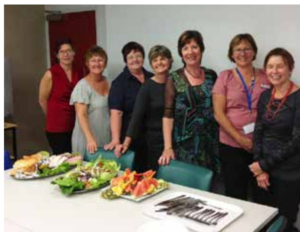
Field Visit participants at Emerald Art Gallery break for a lovely lunch.