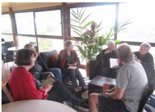
Participants from James Cook Museum, Atherton Chinatown, Tableland Regional Gallery, Broadband for Seniors and M&GSQ discuss their uses of social media.