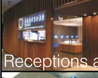
Receptions and Interiors