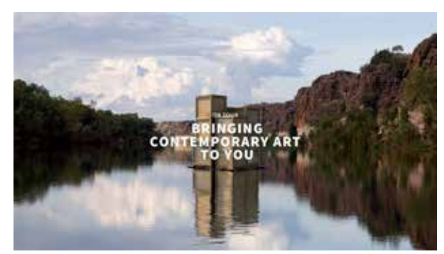
View the new NETS Australia website: http://www.netsaustralia.org.au/

Museum & Gallery Services Queensland is the Queensland agency for NETS Australia.