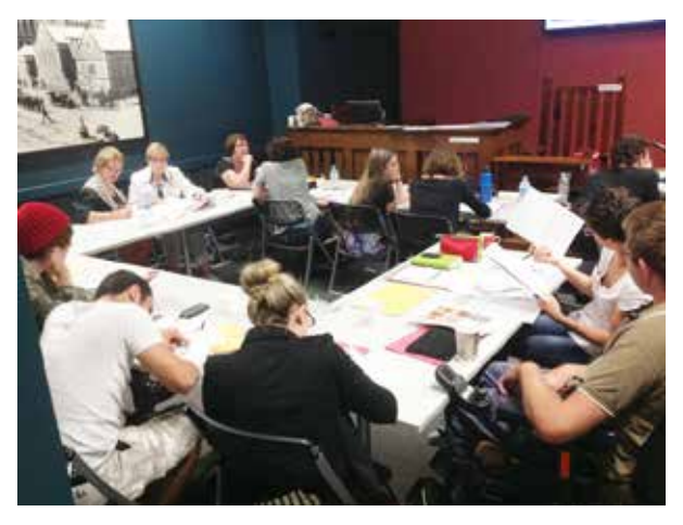
Cataloguing practice at the Queensland Police Museum during the Griffith University Social Enterprise Collection Management Workshop.

Variety of individuals and funding bodies represented.