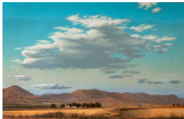
Marcel Desbiens, 'The Passage' Warwick Landscape, 1996. Oil on canvas, 120 x 190 cm. From the Tattersall's Club Landscape Art Prize exhibition.

In 2015 Tattersall's Club will achieve its 150th anniversary. To celebrate this milestone and to mark 25 years of the Landscape Art Prize, Tattersall's Club Committee has made available a selection of fifteen winning entries to tour to regional Queensland centres to share with art lovers and the general public.