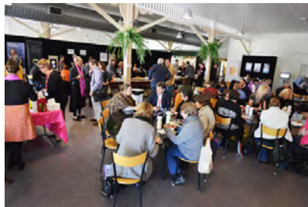
2015 Conference delegates networking over lunch in the Trackside Café at The Workshops Rail Museum, Ipswich.

Delegates were asked 'What were the highlights of this Conference?'