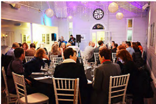
Delegates enjoying the atmosphere of the Darling St Chapel at the Conference Dinner.

The 2015 Conference would not have been such a success without the generous contribution of sponsors and supporters. M&G QLD acknowledges and thanks: