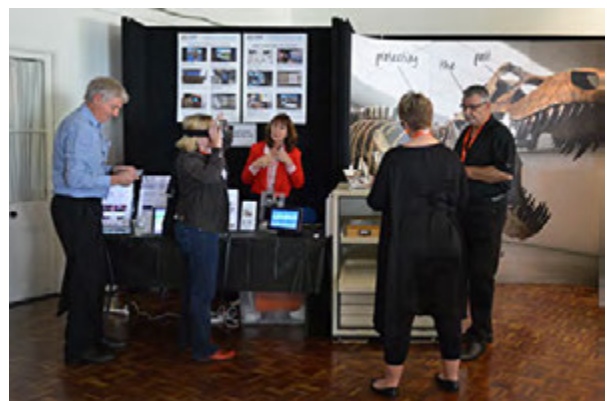
Trade Show exhibitors Dexion and Deep Creek Digital talking with delegates about products and services.