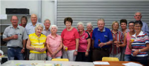
Hard-working volunteers from the Winton District Historical Society enjoy a well-earned celebration following their re-opening.

Winton District Historical Society has welcomed 550 visitors to the Qantilda Museum section of the Waltzing Matilda Centre, since they opened on 1 September following the devastating fire in June. Visitors have enjoyed the range of historic items on display, including items which have been restored after the fire. M&G QLD congratulates Winton on this great achievement.