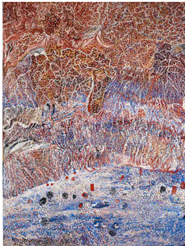
Mavis Ngallametta, Ikalath #6 , 2012. Ochres and charcoal with acrylic binder on stretched linen, 267 x 199 cm. The Corrigan Collection.

Saltwater Country , M&G QLD's international and national touring exhibition of Aboriginal and Torres Strait Islander art, was displayed at Gladstone Regional Art Gallery and Museum, QLD, from 13