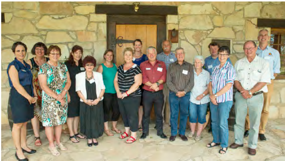
At Longreach for the Standards 2013 Celebration and Debrief.