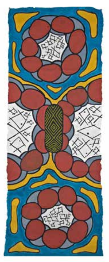
Napolean Oui, Fish Trap, 2014. Oilstick on bark cloth. 195 x 78 cm (framed).

Saltwater Country returns to Australia to show at Manly Art Gallery and Museum, Sydney, NSW from May to June 2015, and then embarks on a national tour from 2015 to 2017.