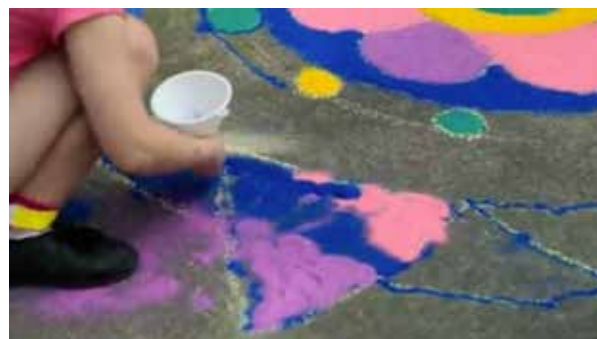
Still from Arts in the Park promotional video.

QUT was tasked to develop an evaluation report based on stakeholder consultation. Each stakeholder group was targeted with a tailored evaluation survey to ensure the most appropriate and nuanced information was gathered. Animating Spaces Logan: Arts in the Park engaged with a very large number of viewers, raising the profile of the city's artists and attracting new audiences. The total number of participants was over double the predicted number.