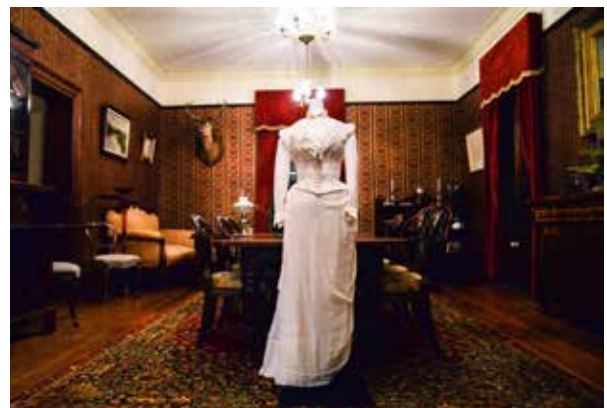
Exhibition display at Newstead House.

The successful outcomes of the project included an audit of the Newstead House textile and fashion collection and completion of a digital database; strong retail sales of the research publication; a 50% increase on visitor numbers; and increased audience engagement.