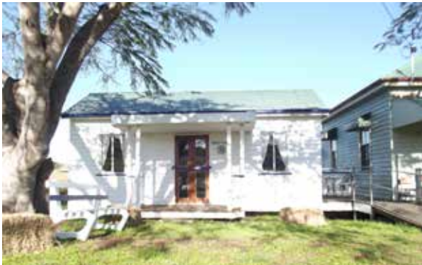
Renovated C.W.A. building.

Fassifern District Historical Society Inc. War Memories including C.W.A. involvement