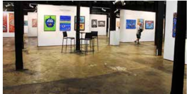
Exhibition installation view at Tanks Arts Centre, Cairns.

For prisoners, any audience on the outside is a new audience. This was the first State-wide exhibition of its scale and profile in Queensland.