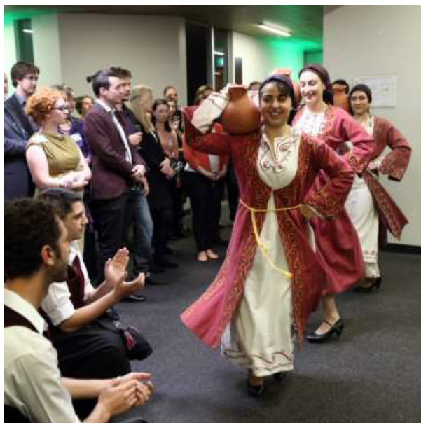
Members of the Cypriot Youth senior dance group perform for assembled guests at the opening of Cyprus: An Island and A People .

Their major exhibition, Cyprus: An Island and A People held in 2014–2015, aimed not only to explore the important place of Cyprus in the ancient world, but to highlight the connection of the modern Cypriot community to their ancient past.