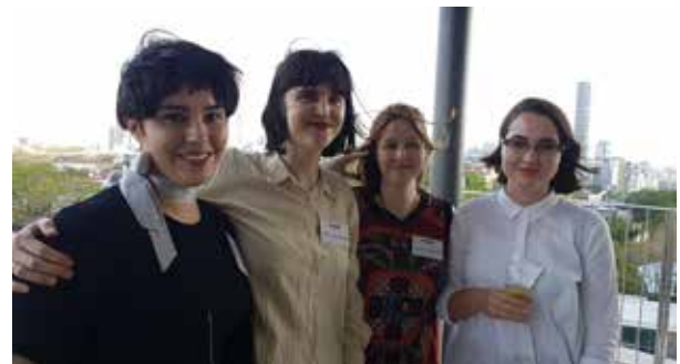
Above: Participants networking over drinks.