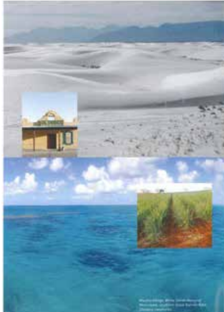
Excerpt from Wide Bay – High Desert II catalogue.