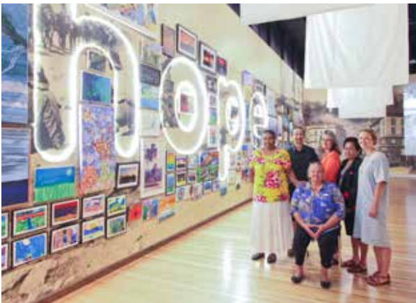
Elders with Peace and Quiet curators.

State Library of Queensland Peace and Quiet