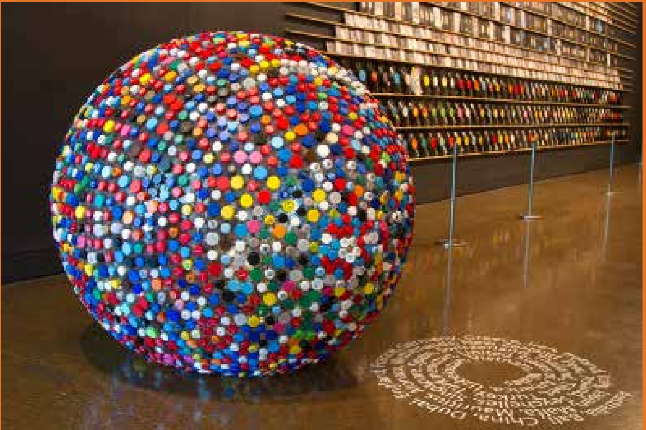
Alison McDonald, Global , 2013. Up-cycled plastic lids, cable ties, PVC, 120 cm x 120 cm. From M&G QLD touring exhibition, Wanton, Wild & Unimagined , showing at Hervey Bay Regional Gallery until 30 July 2017.