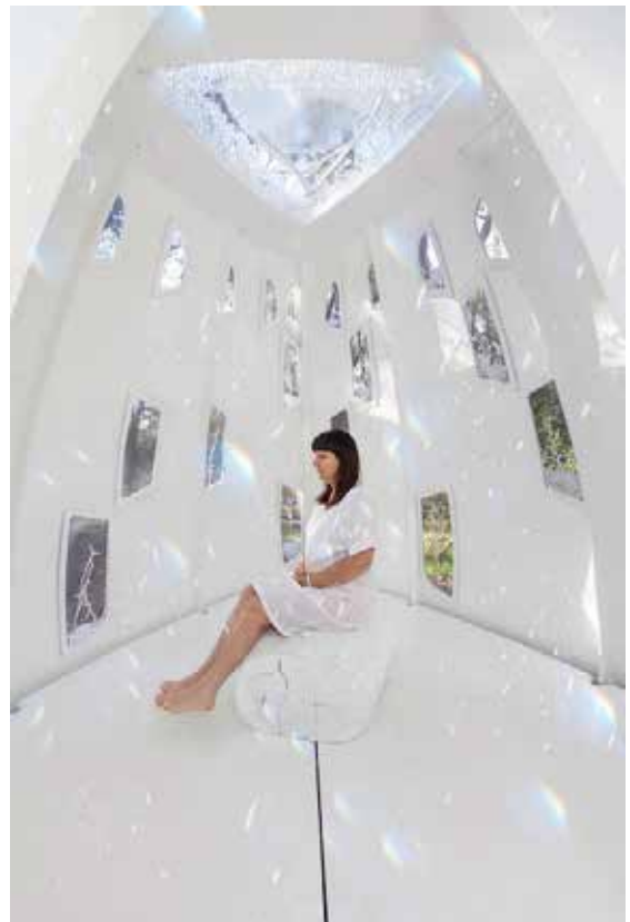
IMAGE: Susan Lincoln, The Rainbow Room (detail), 2014. Moulded fibreglass, polycarbonate, acrylic, lead crystals, paint, timber offcuts, 3.6 m x 4.2 m x 4.2 m x 2.7 m.

Available dates: The exhibition is planned to tour from October 2018 to 2021, dependent upon funding