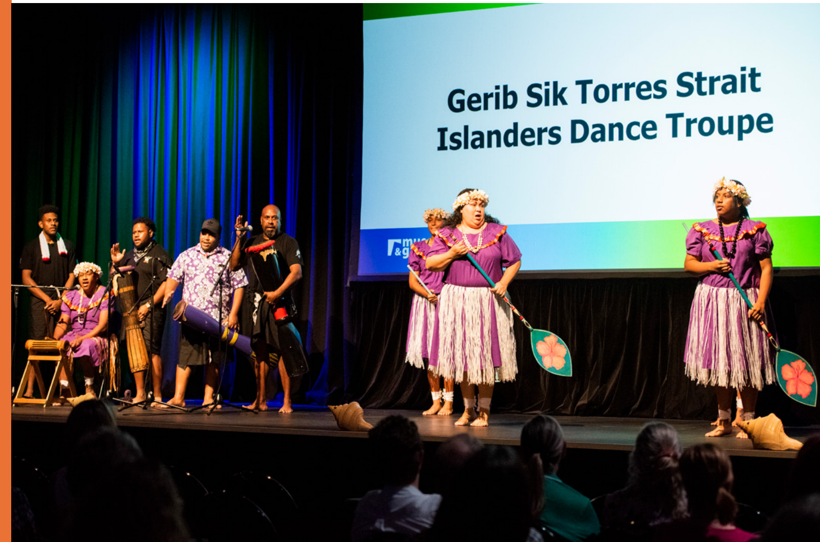
Gerib Sik Torres Strait Islander Dance Troupe performing at M&G QLD's 2019 Conference, Opening Doors , Cairns.