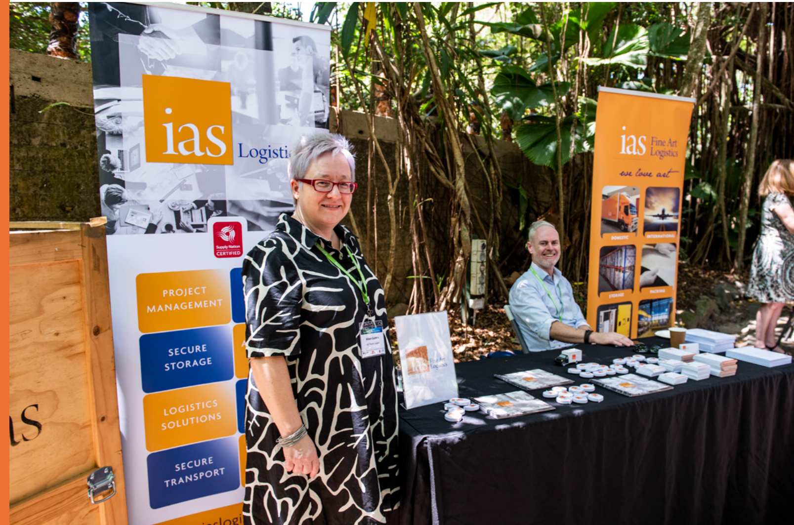
Principal Sponsor, International Art Services' Trade Presentation at M&G QLD's 2019 Conference, Opening Doors , Cairns.