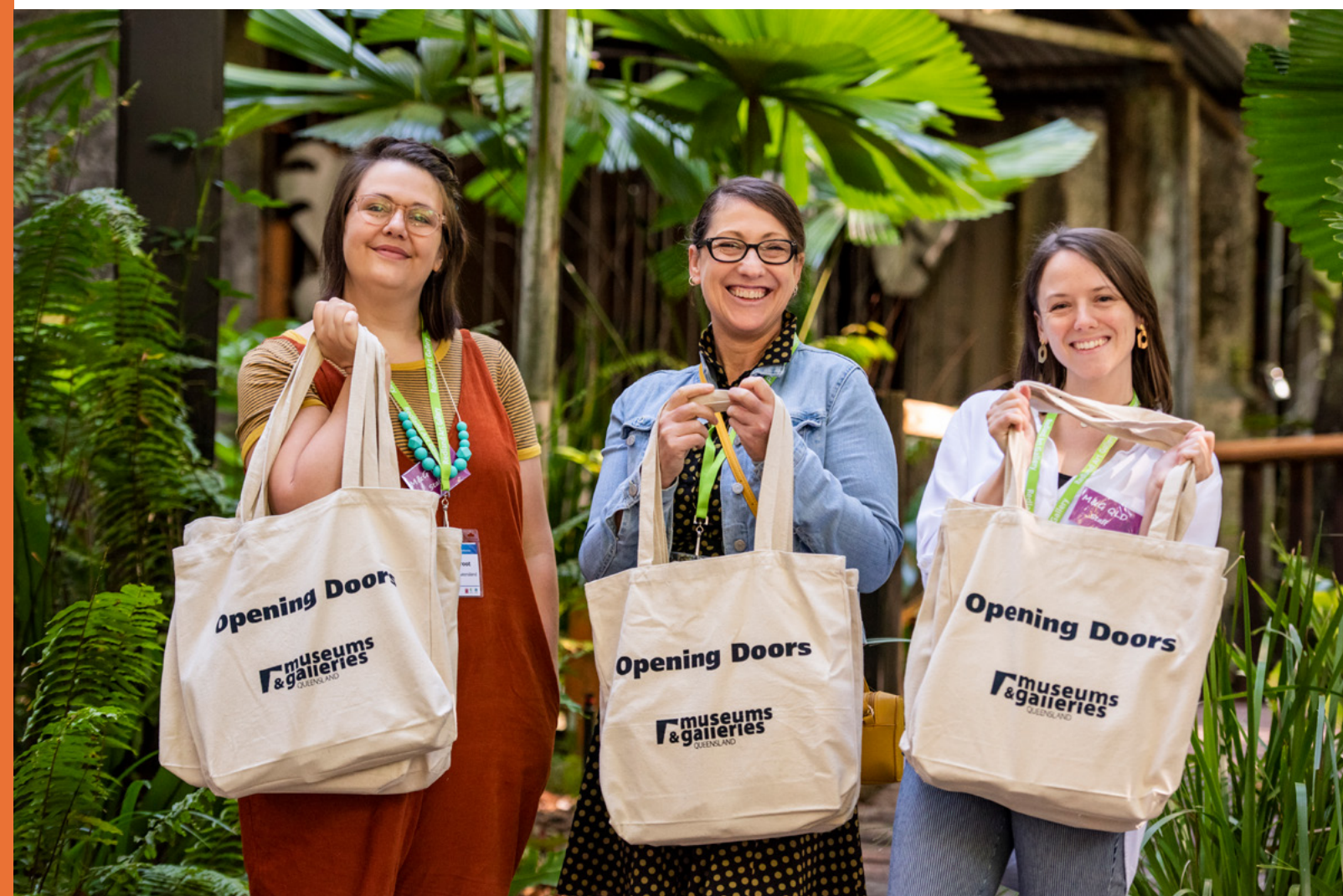
M&G QLD's 2019 Conference, Opening Doors , Cairns.