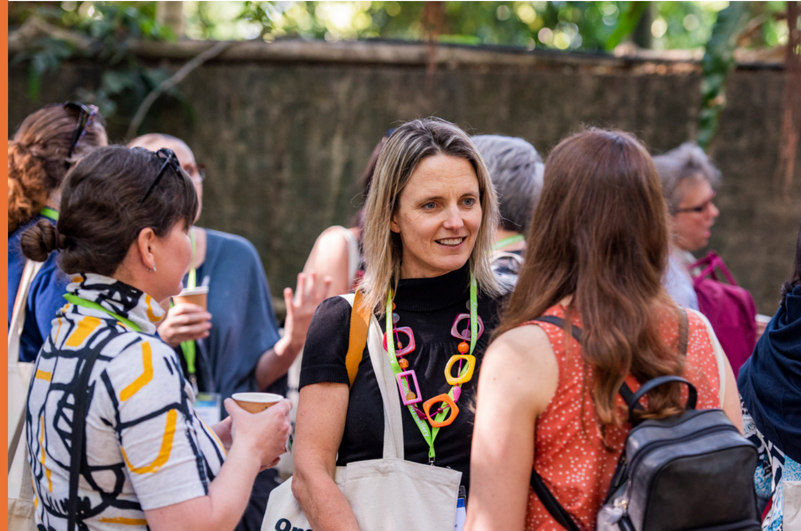
Delegates enjoying coffee and networking at M&G QLD's 2019 Conference, Opening Doors , Cairns.