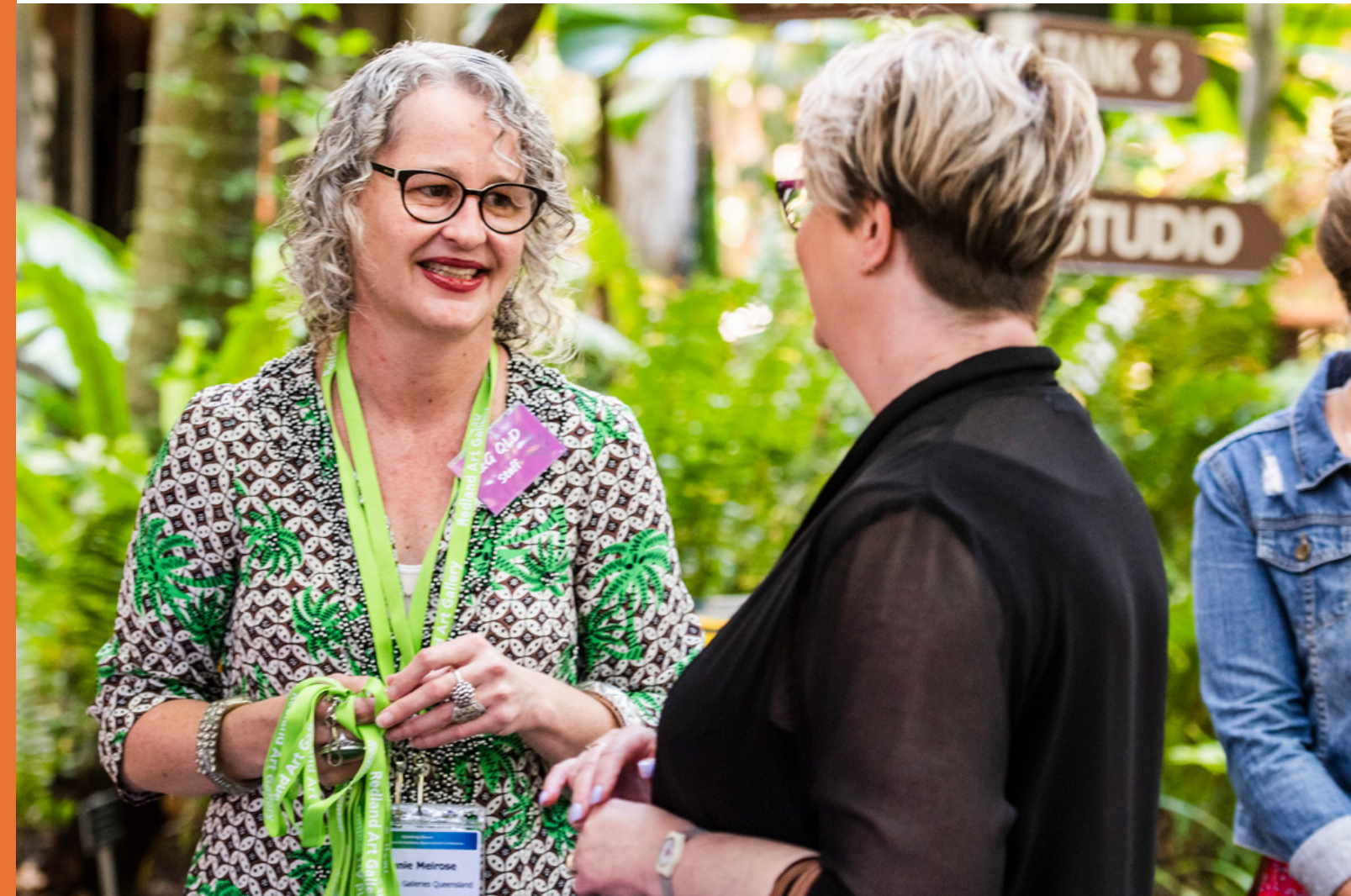
M&G QLD staff greeting delegates at M&G QLD's 2019 Conference, Opening Doors , Cairns.