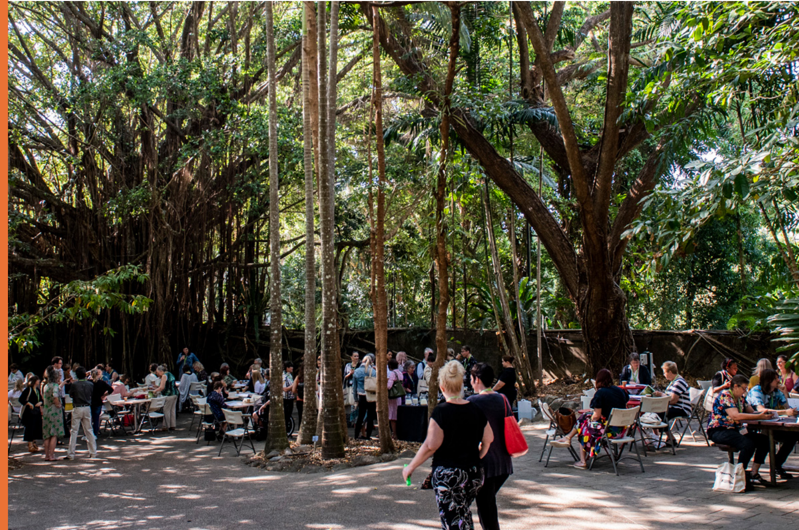
Delegates enjoying lunch at M&G QLD's 2019 Conference, Opening Doors , Cairns.