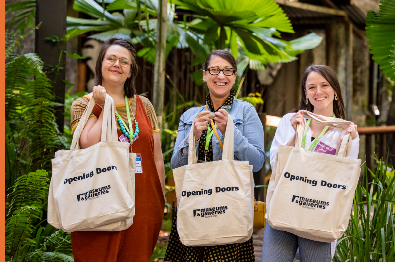
M&G QLD's 2019 Conference, Opening Doors , Cairns.