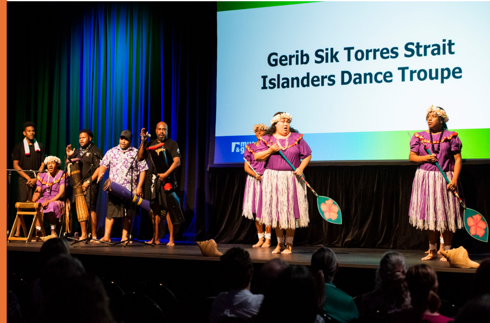
Gerib Sik Torres Strait Islander Dance Troupe performing at M&G QLD's 2019 Conference, Opening Doors , Cairns.