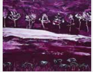
10. Craig Waddell On the Wing 2005 Oil on canvas 150 x 150cm