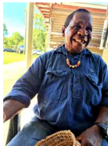
Far left: Art as Exchange participants outside Girringun Aboriginal Art Centre, Cardwell, June 2021.