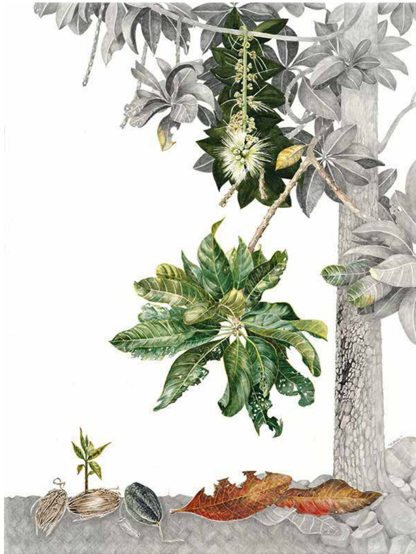
Catherin Bull, Barringtonia calyptrata , mango pine, 2019

Watercolour, graphite on paper, 75.5 x 56.6 cm