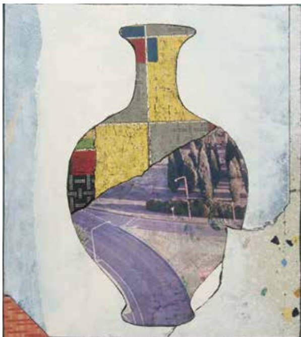
Bruce Reynolds, Vase with Cypress , 2015. Digital print, enamel and linoleum on plywood panel, 45 x 40 x 8 cm.

"Since how we see the past reflects how we see ourselves, the works are intended to question the tableau of history with consideration of the recent and ancient together."