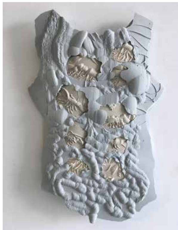
Bruce Reynolds, Wedgewood Cuirass , 2018. Hydrocol, ultramarine pigment, 85 x 60 x 8 cm.

Bruce has had numerous solo exhibitions in Australia and has participated in many group