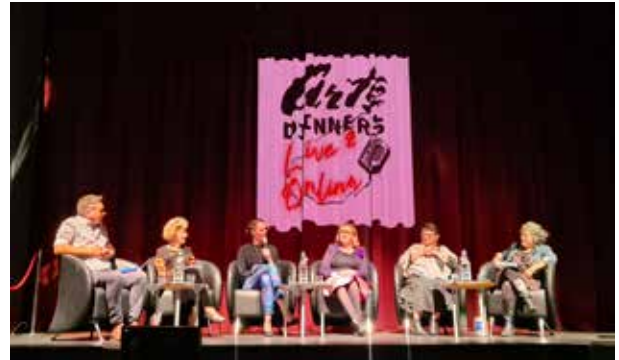
Arts Dinner presenters on stage at The Centre, Beaudesert.