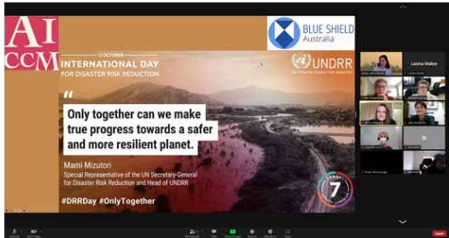
Online launch of the AICCM Disaster Preparedness Calendar.

To test the software for free and learn more about Curio Publisher, go to www.curiopublisher.com